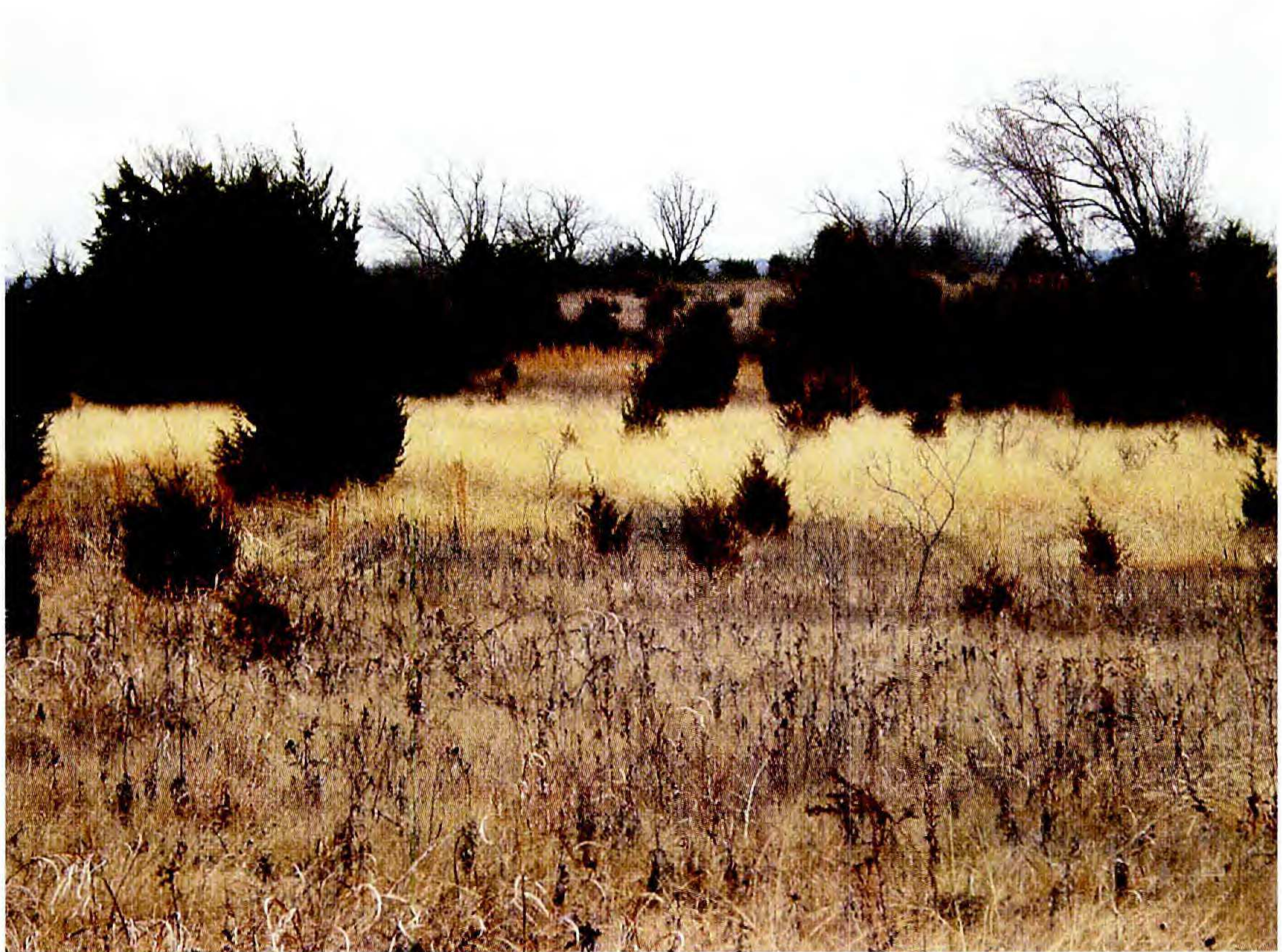
FIG. 2. Area of Blackland Prairie in Grayson County showing invasion by woody vegetation under current fire suppression conditions

some other mechanism or mechanisms must have been responsible for the historical difference in the vegetation on the clay Prairies and sandy Woodlands.